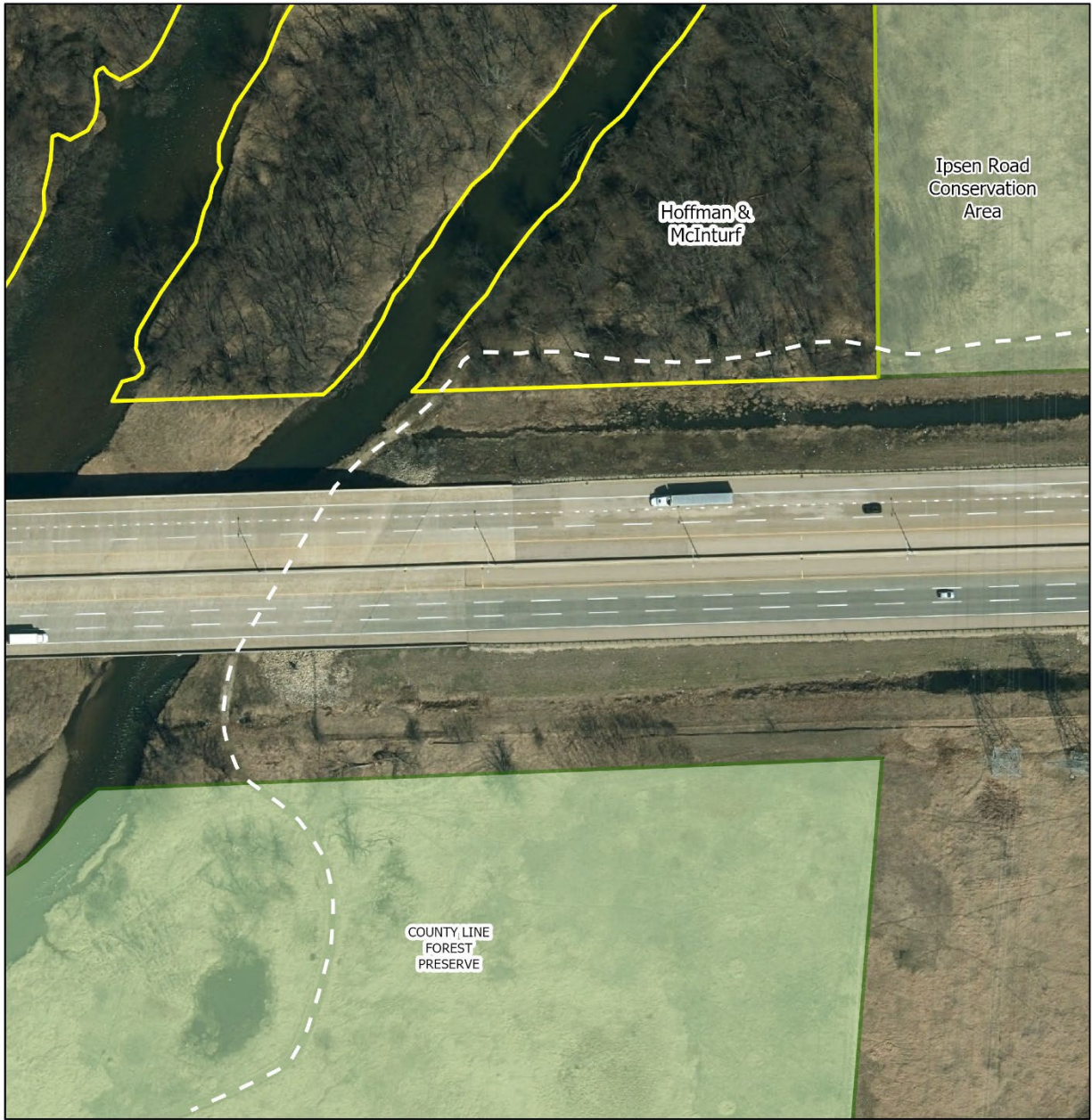
Exhibit A: Trail location map