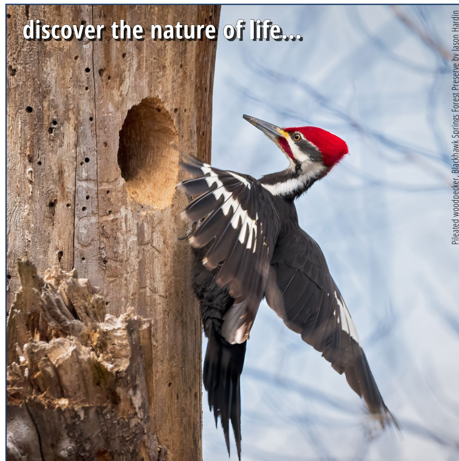
Pileated woodpecker, Blackhawk Springs Forest Preserve

11,639 acres • over 100 miles of hiking trails • 3 campgrounds • 3 golf courses ...endless possibilities