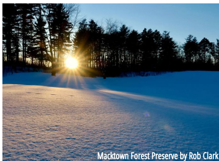
Macktown Forest Preserve

Spring Clean at Macktown Sunday, March 22, 2026