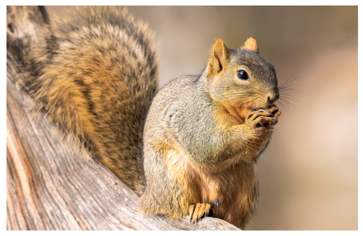
Fox squirrel (Sciurus niger)

The Fox squirrel ( Sciurus niger ) is the largest tree squirrel in Illinois. Their fur has an overall redish tint, with a mix of rusty-yellow and black. Fur is lighter on the ears, belly, and parts of the tail.