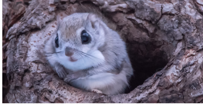
Southern flying squirrel (Glaucomys volans)

Weighing in at only 2 ounces, the Southern flying squirrel ( Glaucomys volans ) is the smallest tree squirrel in Illinois. They can't actually fly, but the extra folds of skin on their body allow them to glide from tree to tree. Southern flying squirrels are mostly found in Southern Illinois.